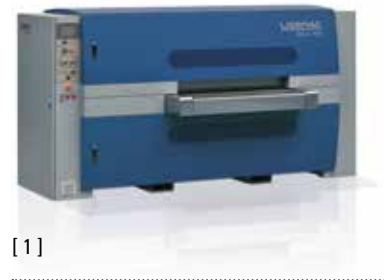
[ 1 ]